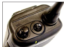
IC-F21S Toggle type radio