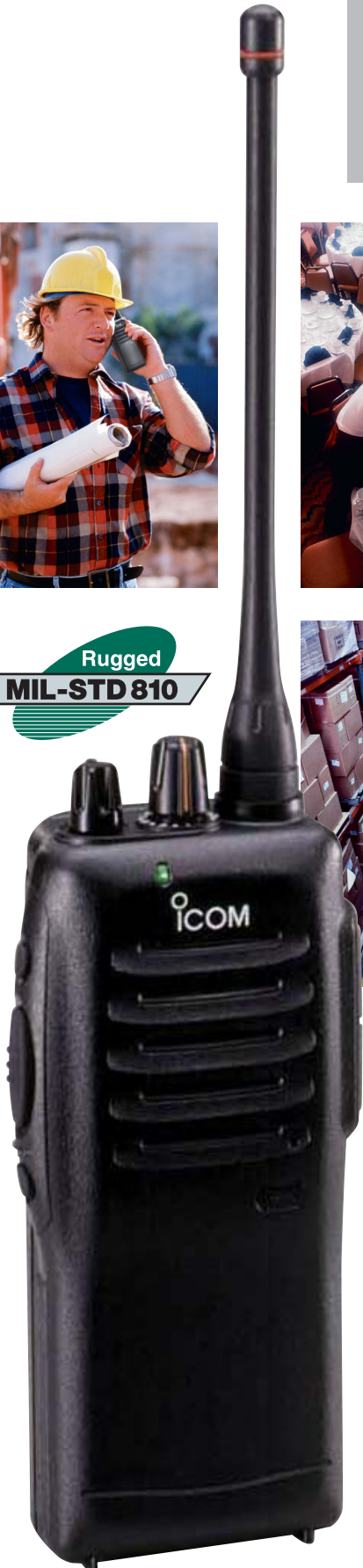
IC-F21 Rotary type radio